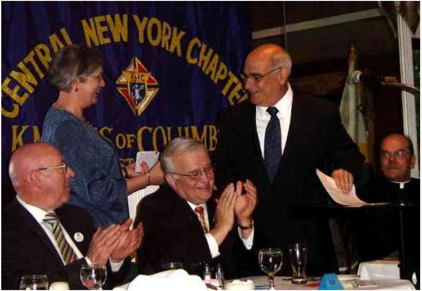
The Knights of Columbus giving their generous support.