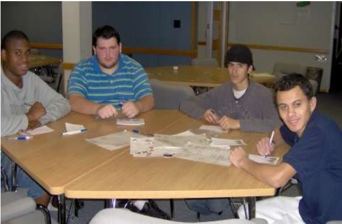
Students in Religious Education class at NYSSD writing Christmas notes to special friends at Loretto.

Mail to: Catholic Deaf Community PO Box 572 Rome NY 13442-0572